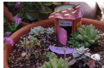
2017 Challenge Grow